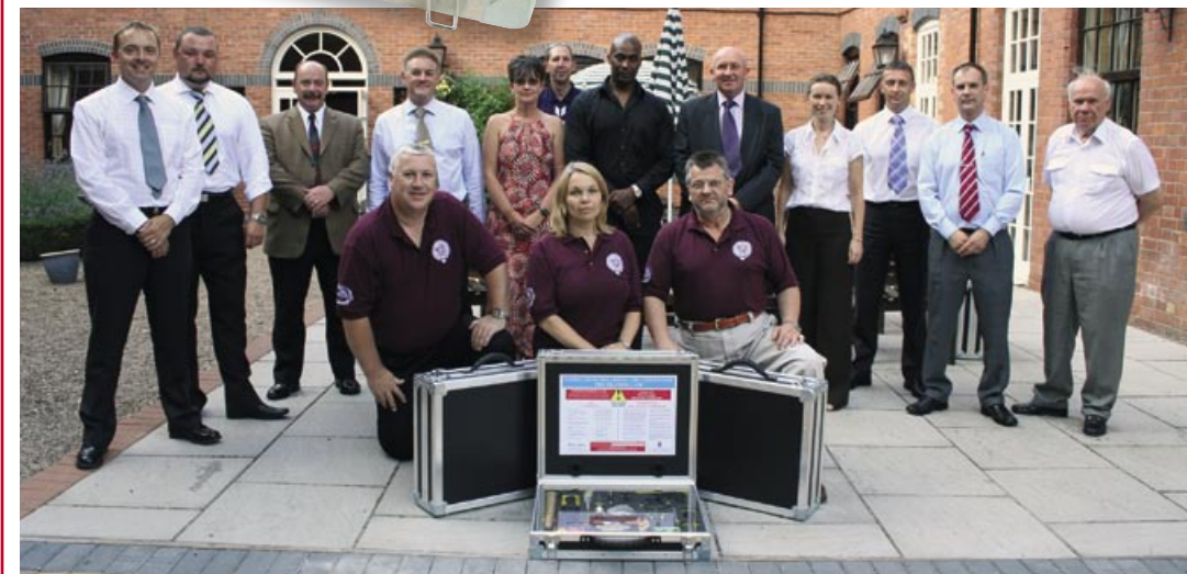
The PS5 Training Team with the all the delegates of the very first Basic Weapons Awareness Training Course

Regardless of how much sophisticated electronic detection equipment your personnel have at their disposal, if they don't know what they are looking for they won't find it. A lack of basic awareness and weapons recognition will result in security breaches.