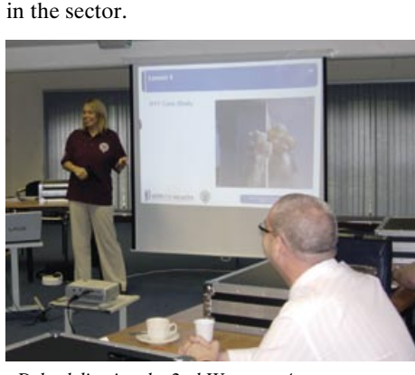
Debs delivering the 2nd Weapons Awareness course

The course received a very positive reaction and all the delegates without exception felt that it was an extremely informative and well designed course. Delegates viewed the course as a balanced mix of theory and practice and were impressed with the purpose built weapons training case designed by PS5 that they took away with them at the end of the course. Here at Skills for Security, we are delighted with the positive feedback that we have received regarding this innovative new training course. With the number of crimes involving knives, firearms and imitation firearms reportedly increasing we at Skills for Security firmly believe that it is our duty to equip our sector's trainers and their students with sufficient knowledge to recognise weapons concealment and respond to any weapons related incidents in a calm professional and safe manner. We feel that the new Basic Weapons Awareness & Recognition Programme addresses this need and we feel sure that this will become an invaluable programme for anybody working in the sector.